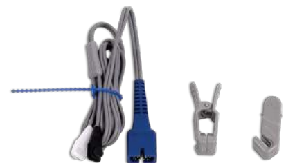
Nellcor Veterinary SpO 2 Sensor