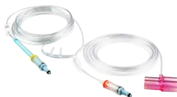
Veterinary EtCO 2 Sampling Lines