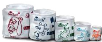
Suntech Veterinary NIBP Cuff