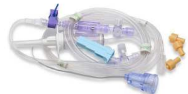
Veterinary IBP Connector