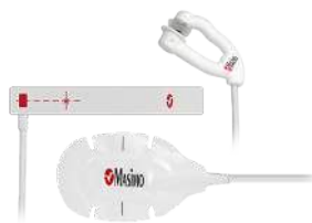
Masimo Veterinary SpO 2 Sensor