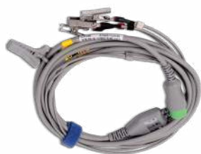
Veterinary 3-lead ECG Cable (Monitor)