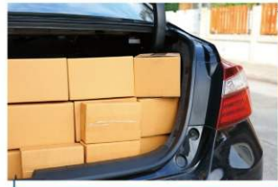
Easy for transportation