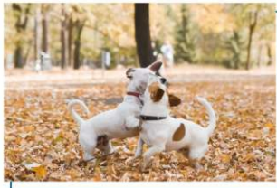
Suitable for outdoor