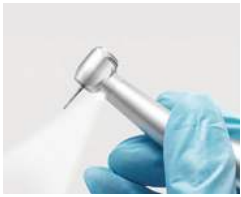
High-Speed Handpiece for Cutting

NEO V Pro integrates multiple functions, X-ray shooting, cleaning, grinding, polishing, cutting to help veterinarians complete comprehensive treatment of animal dental diseases more efficiently.