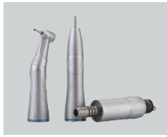
Low-Speed Handpiece for Polishing