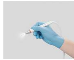
Detachable LED Scaler for scaling / cleaning